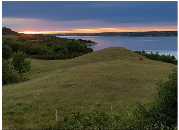
Over 200 acres of land to hike and explore