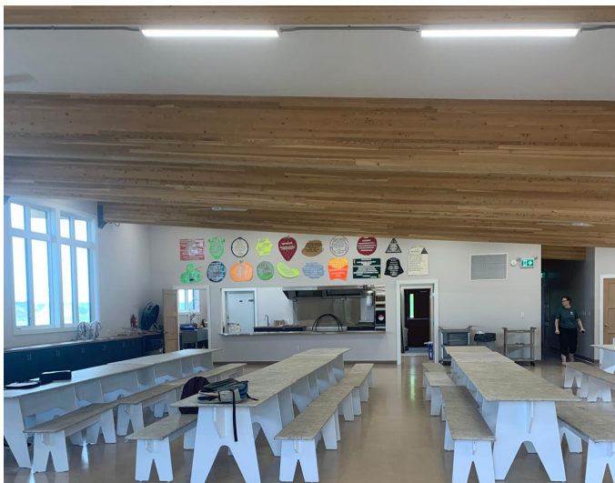
Dining Hall seats approximately 100 - 150