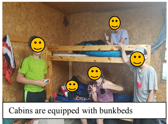
Cabins are equipped with bunkbeds