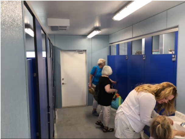
New, modern washroom and shower facilities