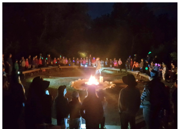
Large fire pit with benches